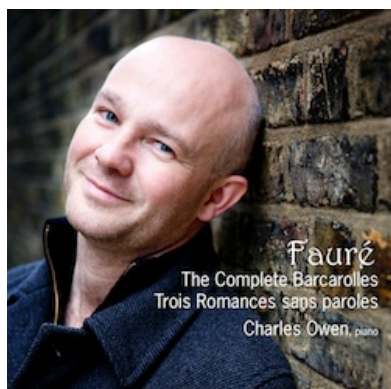
Fauré The Complete Barcarolles AV 2240