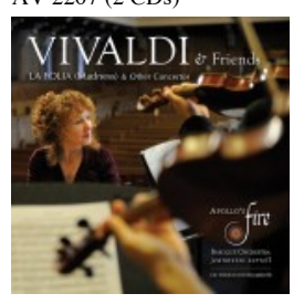
Vivaldi & Friends AV 2211

Recorded at St. Paul's Episcopal Church, Cleveland Heights, Ohio